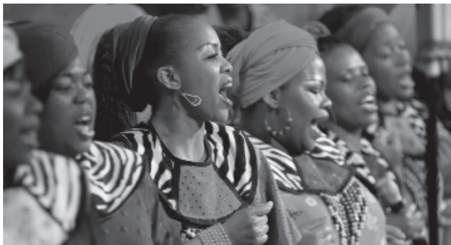
The Soweto Gospel Choir

For a complete listing of performances, visit www.sevendaysfestival.org . Tickets are available online at www.tickets.fsu.edu .